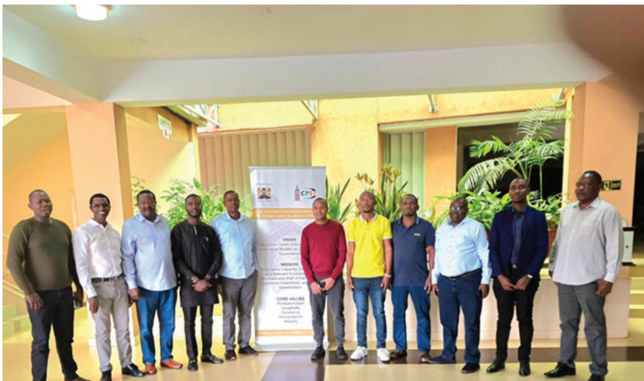
Members of the National Assembly's Departmental Committee on Energy pose for a photo after completing a one-week training on Legislation, Monitoring and Evaluation offered by the CPST.

T he CPST in collaboration with the National Assembly Departmental Committee on Energy in June mounted a one-week training for the Committee Members on Legislation, Monitoring and Evaluation.