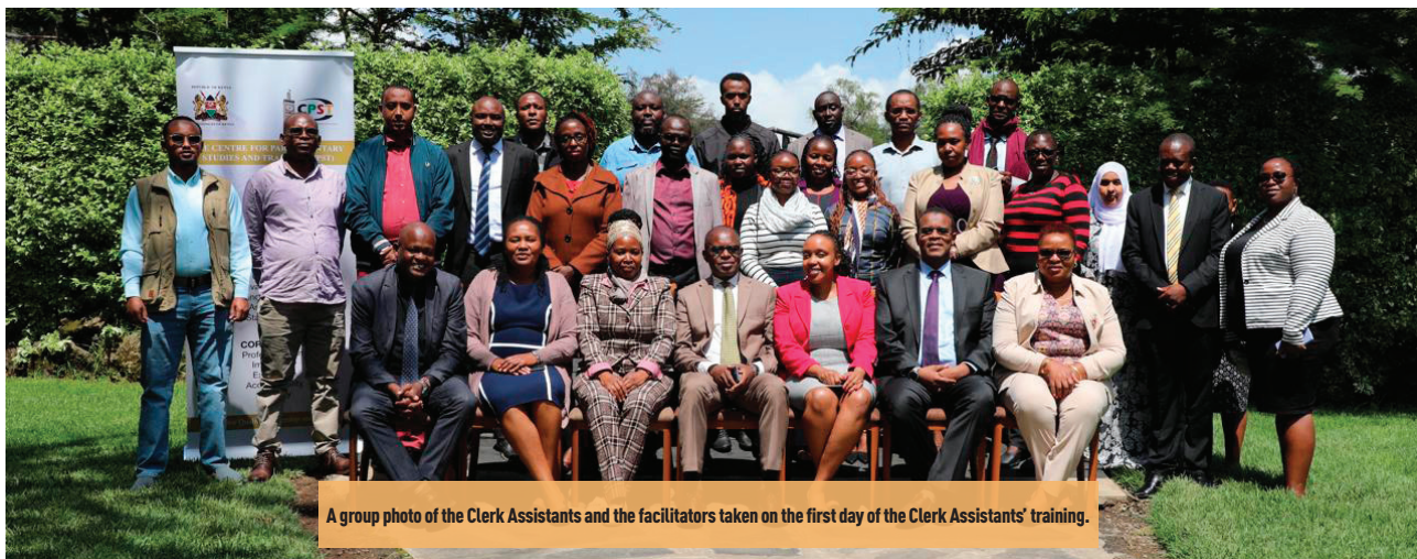
A group photo of the Clerk Assistants and the facilitators taken on the first day of the Clerk Assistants' training.