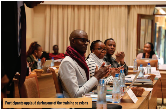
Participants applaud during one of the training sessions

The validated curriculum will undergo final adjustments before being officially launched, marking the beginning of an exciting new chapter for CPST and JKUAT.