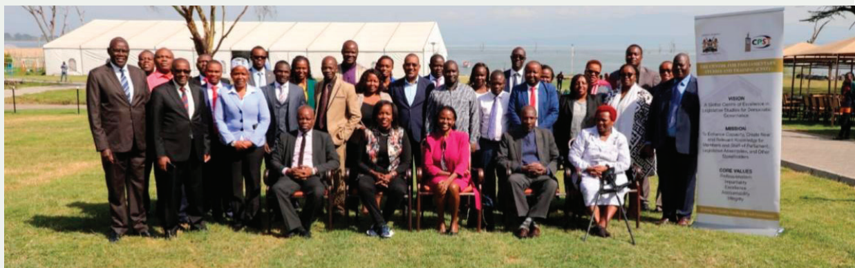
Staff from PSC and JKUAT during the validation of the draft curriculum and course contents of the MSc. Leadership and Governance Programme led by the Executive Director CPST, middle seated, and the Principal JKUAT, (Second from Left seated).